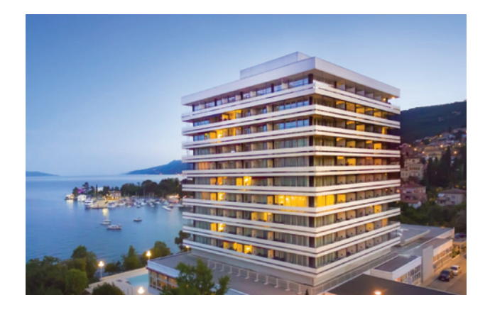
Remisens Premium Villa Ambasador ****