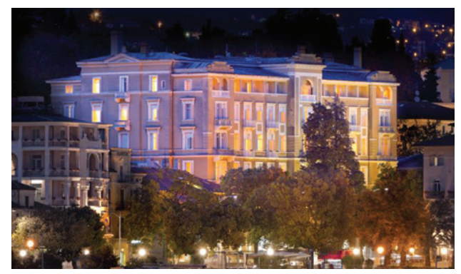
Hotel Imperial ***

Single room - bed and breakfest from: € 49