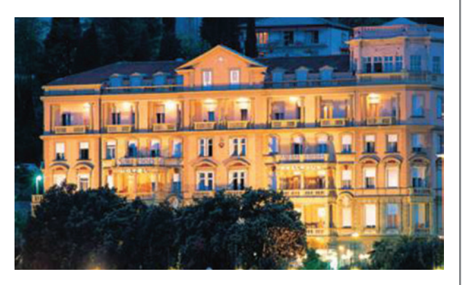
Hotel Palace - Bellevue****

Single room - bed and breakfest from: € 82